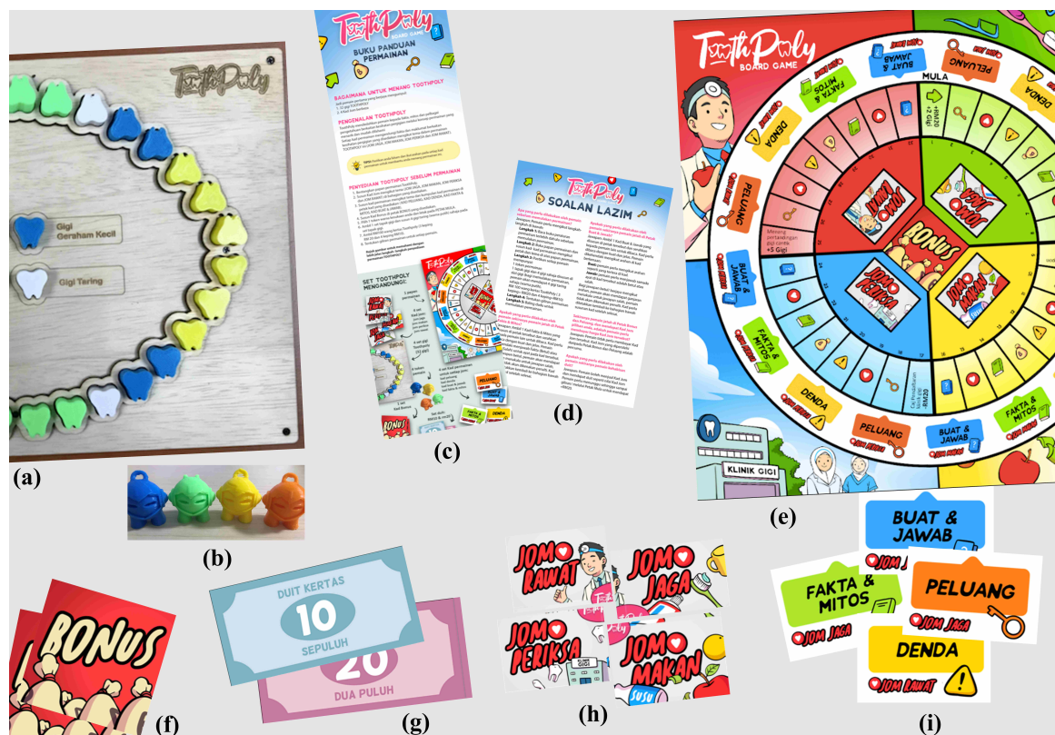
FIGURE 1. ToothPoly board game set. (a) Teeth set, (b) Game token, (c) Instruction pamphlet, (d) FAQ pamphlet, (e) ToothPoly game board, (f) Bonus cards, (g) ToothPoly money, (h) Jom cards, (i) Game cards.

of the key findings derived from the discussion. To ensure the credibility and accuracy of the data, verification of the findings was also obtained from the participants following the completion of each FGD session. Each child was given a voucher (MYR 10) as a token of appreciation. The FGD was continued with the next group of children until data collection reached saturation level. At this point, the FGD was stopped and data collection was deemed completed.