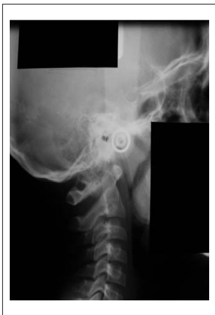
Figure 1. Cephalogram without revealing the identification, age and dental elements of the patient

The sample was composed of 100 cephalograms of patients presenting for orthodontic treatment at the