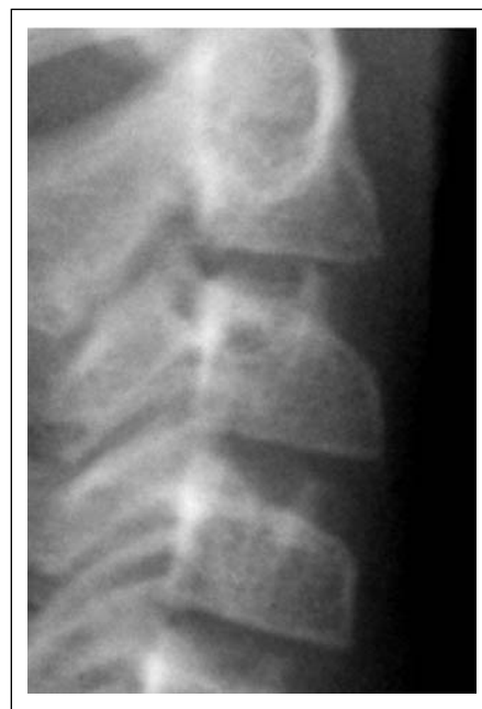
Figure 2. Visualization of the 2nd 3rd and 4th cervical vertebrae in the CVMS I.