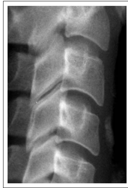
Figure 6. Visualization of the 2nd 3rd and 4th cervical vertebrae in the CVMS V.

Figure 4: CVMS III. A concavity at the lower bor-