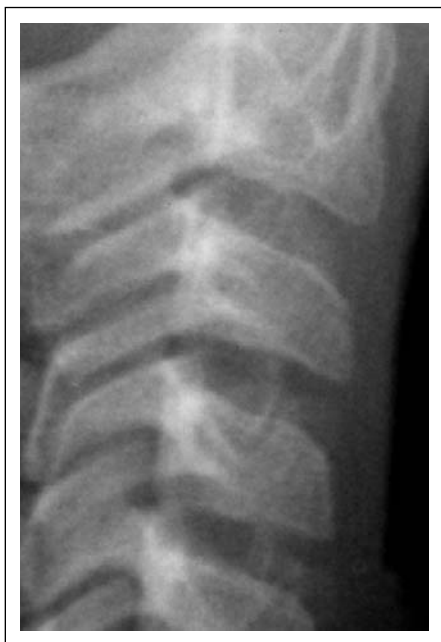
Figure 3. Visualization of the 2nd, 3rd, and 4th cervical vertebrae in the CVMS II.