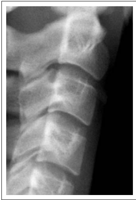
Figure 5. Visualization of the 2nd, 3rd, and 4th cervical vertebrae in the CVMS IV.

Faculdade de Odontologia de Araçatuba, UNESP. The sample included both male and female with ages ranging from 6 to 16 years old with the average age of 9 years and 7 months old. The cephalograms were made according to protocol 19 which is recognized by the Discipline of Radiology at UNESP.