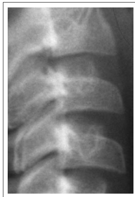
Figure 4. Visualization of the 2nd, 3rd and 4th cervical vertebrae in the CVMS III.