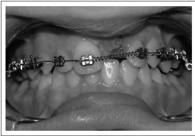
Figure 4. Intraoral frontal view during orthodontic treatment