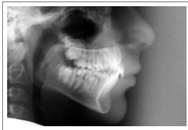
Figure 3. Initial lateral cephalometric radiographic view