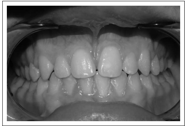
Figure 5. Intraoral frontal view after orthodontic treatment

To maintain the Class I molar position, the cervical headgear was continued 10 to 14 hours/day. While the molar position was stabilized, the premolars drifted distally into a Class I occlusion and the canines were retracted using light forces. Incisor retraction was achieved with Class I elastics and sliding mechanics.