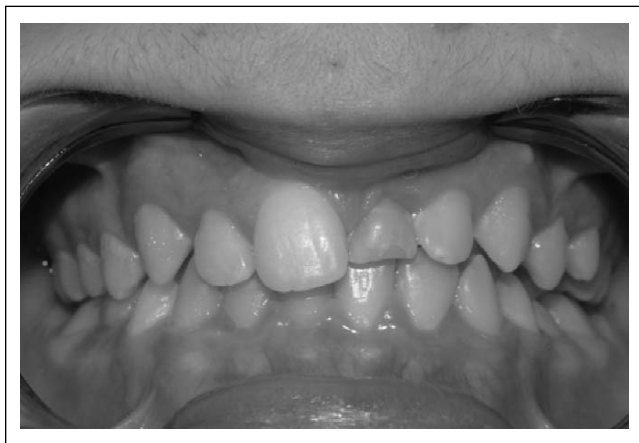
Figure 1. Initial intraoral frontal view