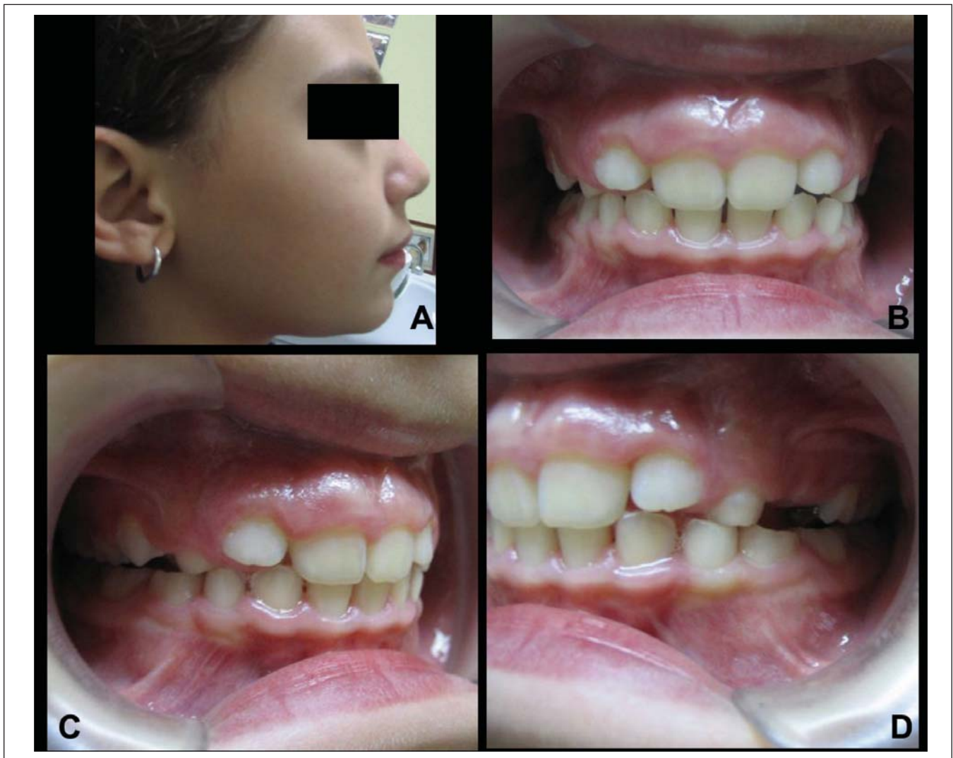
Figure 3. Patient photographs after 12 months of treatment with the T4K. (A) Extra-oral photograph showing the profile; (B) Occlusion frontal view; (C) Occlusion right side; and, (D) Occlusion left side

The differences between before and after treatment measurements were higher than those expected to be produced by natural growth in Brazilian females. The natural growth for the maxilla and the mandible for a 10 to 11 year old Brazilian female is expected to produce an increase of 0.2^\circ for both SNA and SNB angles, and a reduction of 0.1^\circ in the ANB angle. In the case here presented, point A moved forward 0.8^\circ and point B moved 4.5^\circ , which reduced the ANB angle by 3.8^\circ . Additionally, the distances Co-Gn and Co-A increased 4.3 and 4.1 mm respectively, while the natural growth for those distances is expected to produce an increase of 2.8 and 1.7 mm respectively. Vertically, the ANS-Me distance increased by 3.1 mm; this is higher than that expected from natural growth (1.1 mm). The values for the cephalometric measurements performed before and after treatment, the correspondent matched values of normative data for 10 and 11 year olds and the differences between before and after treatment are shown in Table 1.