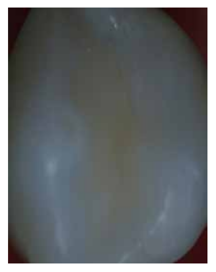
Figure 2 – shows occlusal surface of Sample 1 using Technique 2 (c) was given a score of 1 as discoloration/cavitation was observed